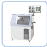
Nondestructive inspection equipment