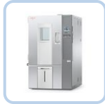
Environmental testers, analyzers