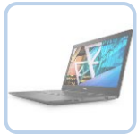
ICT related equipment

Lease service for Customer's Selected Equipment, which is general specification, Thai ORIX purchase and lease deduct future value. We can also provide the equipment from the stock owned by ORIX Rentec Corporation in Japan, if it is not available in Thailand.